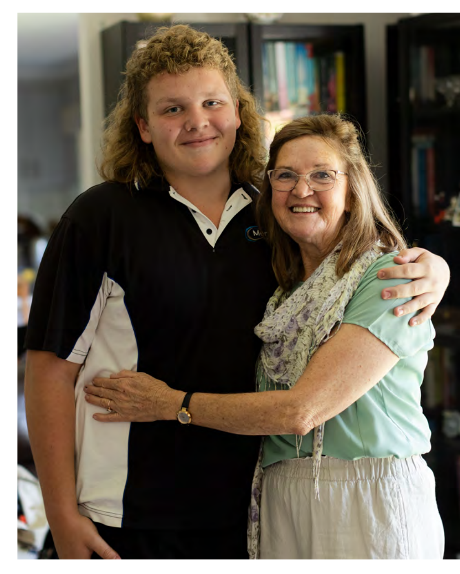
RAV acknowledges the funding and support received to run these important programs; including the Australian Government Department of Social Services and Department of Health, and Gippsland Primary Health Network.

The primarily outreach-based service provides multimodal counselling and case management to connect children with education, personal, physical or community services.