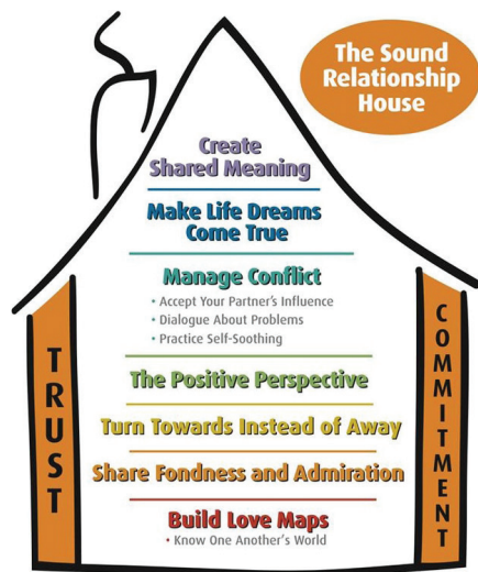
Copyright © 2000–2011 by Dr. John Gottman. Distributed under license by The Gottman Institute, Inc.

According to Dr Gottman a good relationship requires you to build a 'Sound Relationship House'. The Sound Relationship House has several floors which help support the floors above. The first floor relates to Building Love Maps. Simply put, knowing the small stuff about your partner's life and making room for that in your head, helps you build love and intimacy. Just like you, your partner's views and preferences may change over time, so keeping love maps up-to-date is necessary. Having deep, current knowledge of each other is the goal of love maps. To learn more about building love maps visit this website. https://www.gottman.com/blog/build-love-maps/